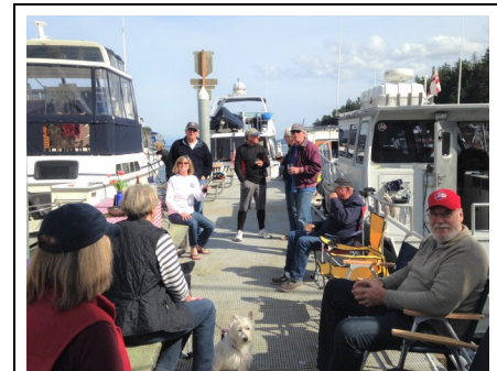
Sucia Island Cruise 2015