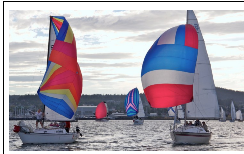
Wednesday Night Racing 2014

Fortunately, our sailing season is only just beginning. Hopefully, we will be able to get our program started again though social distancing has just been extended another month. That's still just May, but many of us don't get much sailing before then anyway. Suggestions are requested, if you have ideas on